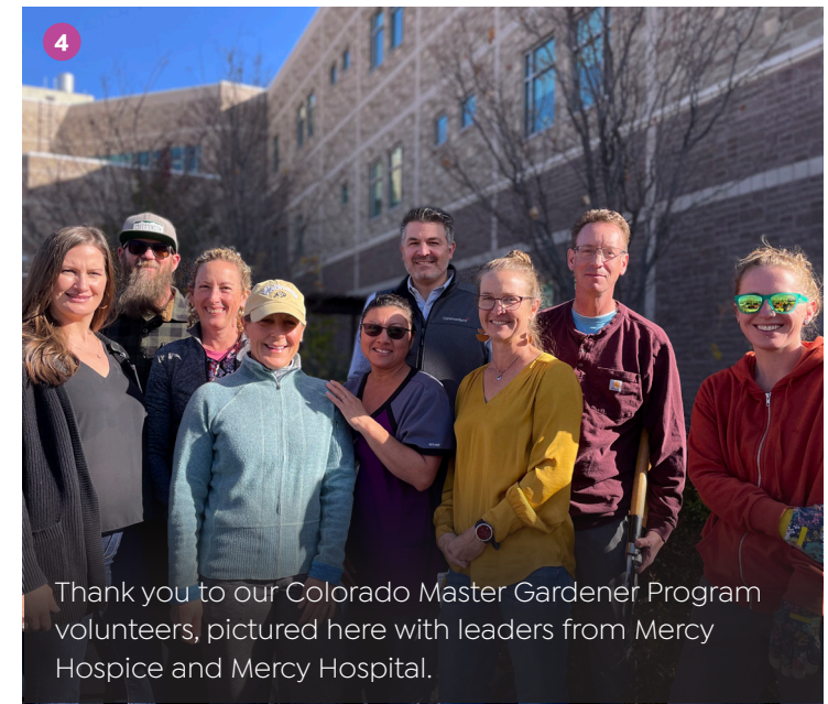
Thank you to our Colorado Master Gardener Program volunteers, pictured here with leaders from Mercy Hospice and Mercy Hospital.