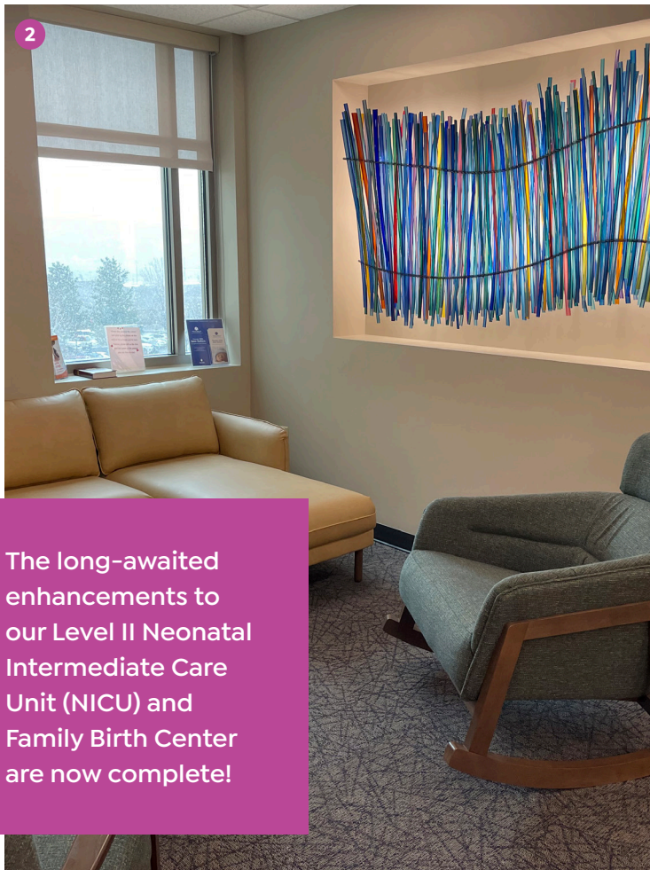
The long-awaited enhancements to our Level II Neonatal Intermediate Care Unit (NICU) and Family Birth Center are now complete!